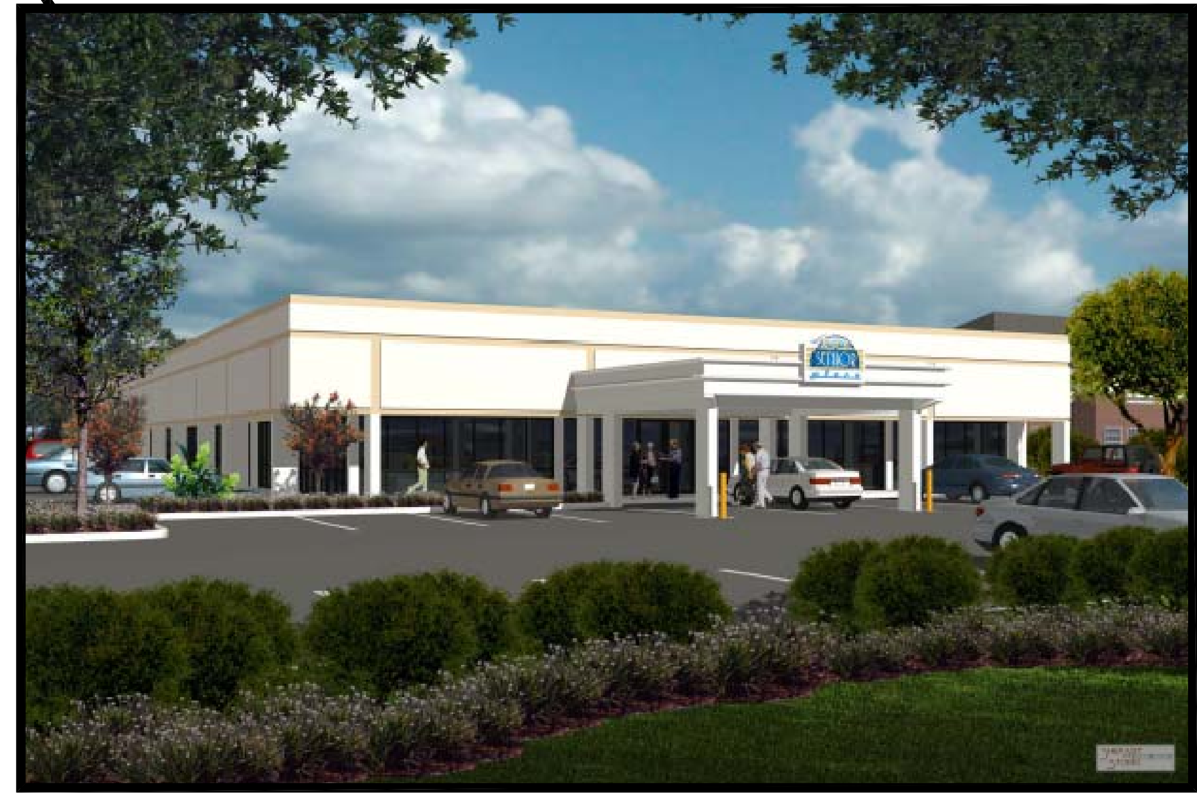
FRONT PERSPECTIVE VIEW