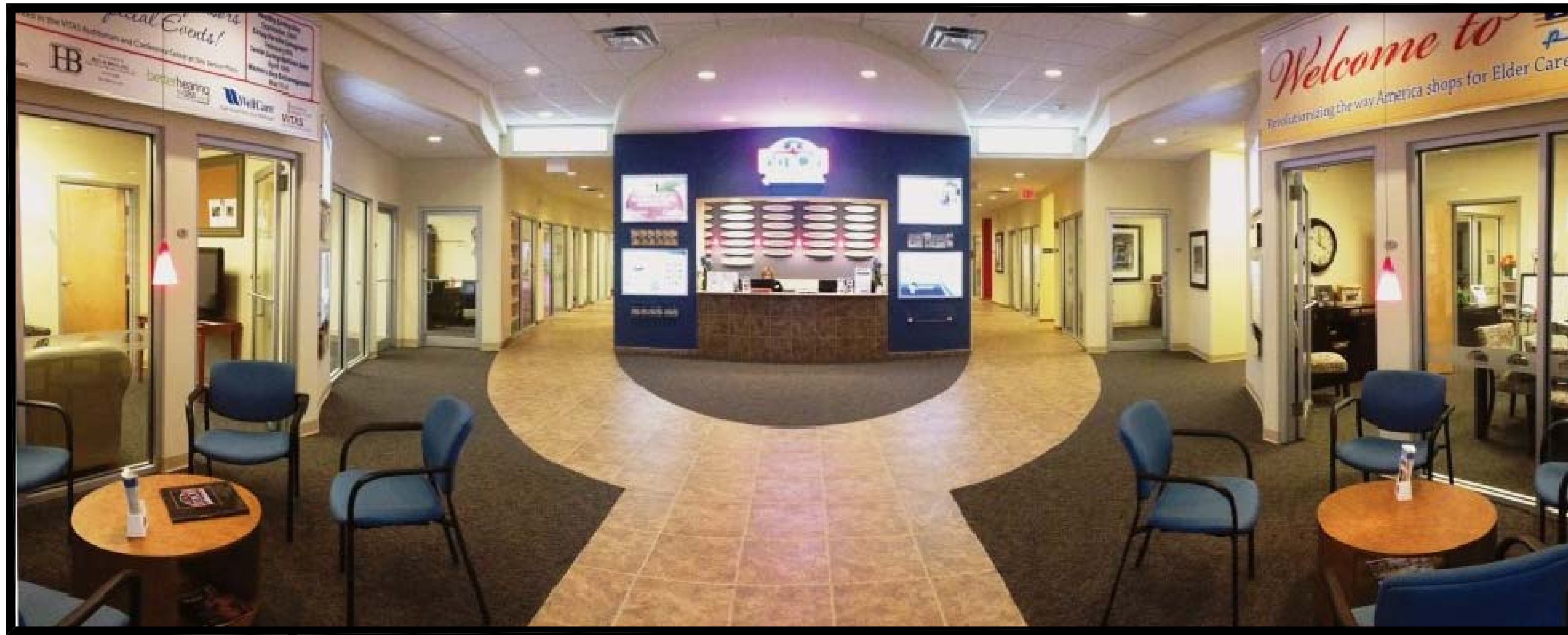
FINAL INTERIOR ENTRY