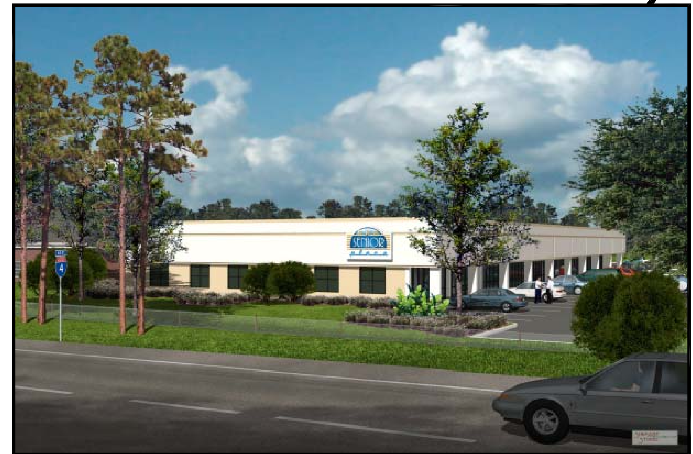
REAR PERSPECTIVE VIEW FROM 1-4