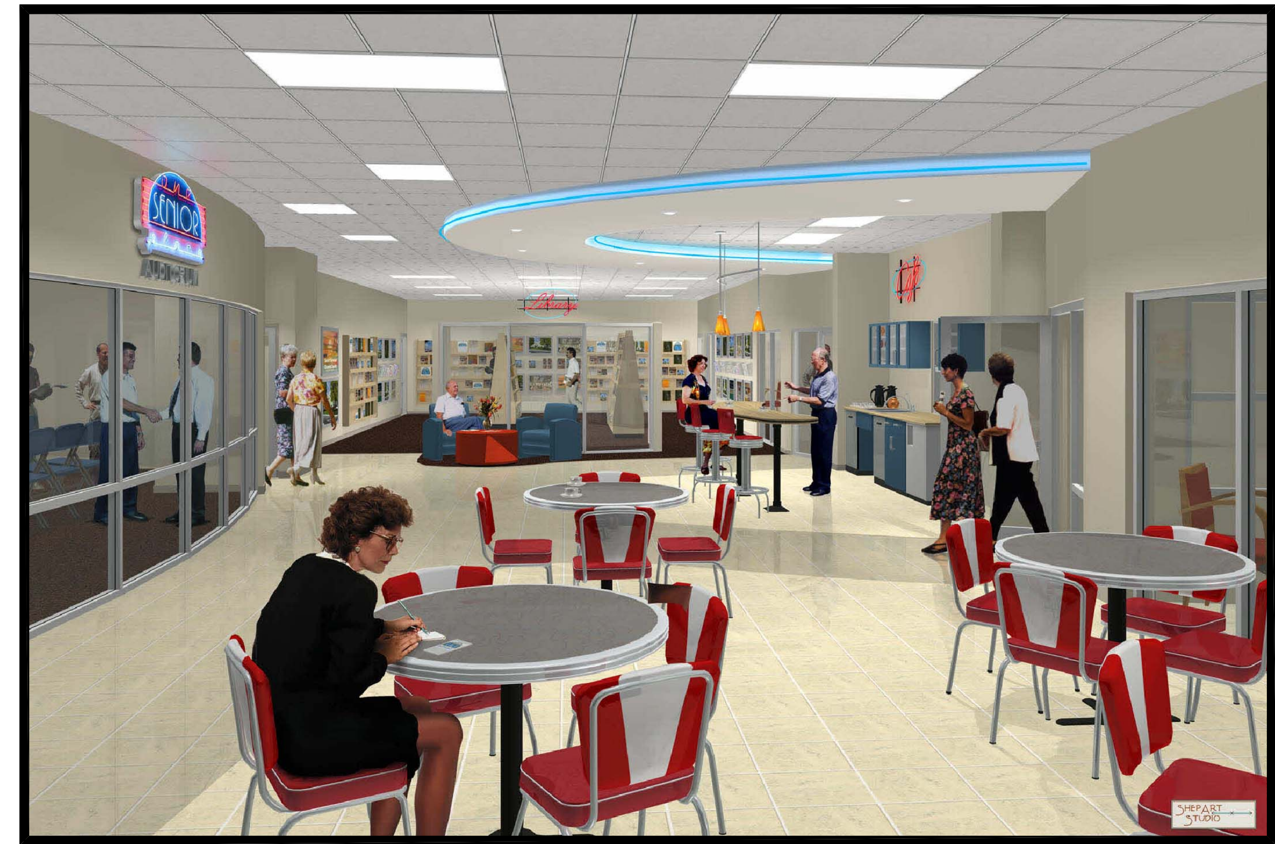
INTERIOR PERSPECTIVE VIEW